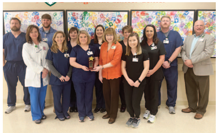
Anderson Regional Cancer Center