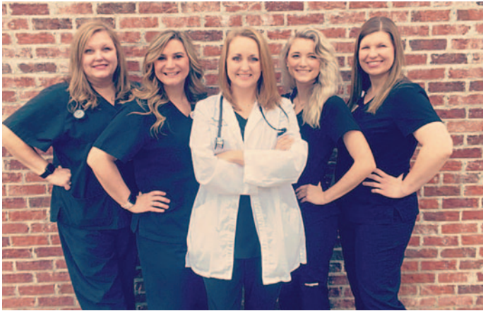
Anderson - Enterprise Family Medical Center

Congratulations to the following departments that had the highest overall patient satisfaction rating in the second quarter!