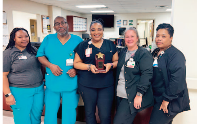
Swing Bed Unit