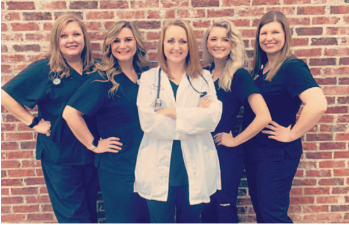
Anderson - Enterprise Family Medical Center

The first quarter Service Excellence honors — for departments that had the highest overall rating — were: