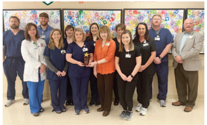
Anderson Regional Cancer Center