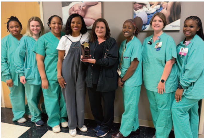
Labor & Delivery