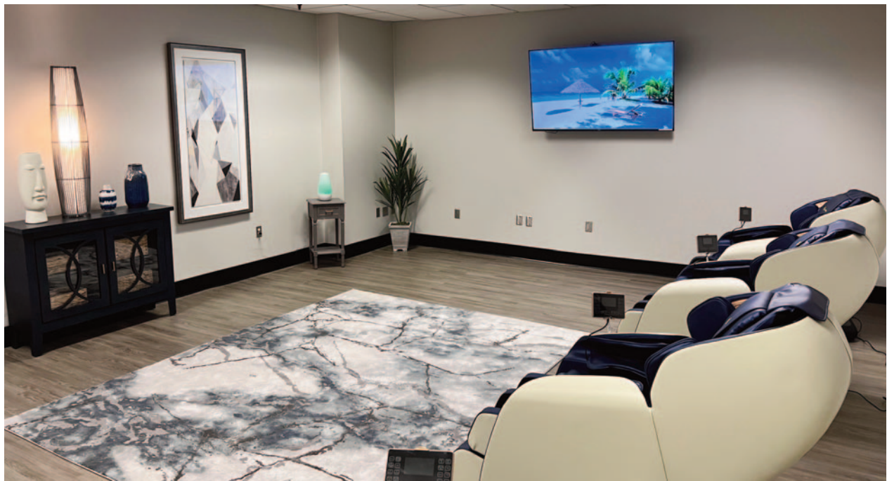
The Oasis Room features massage chairs, aromatherapy and more.