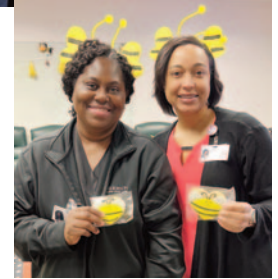
At the introduction of the new BEE Award program, staff were treated to bee-shaped cookies.