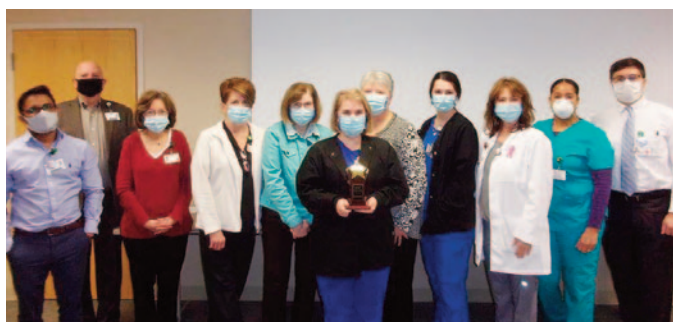
Anderson Regional Cancer Center